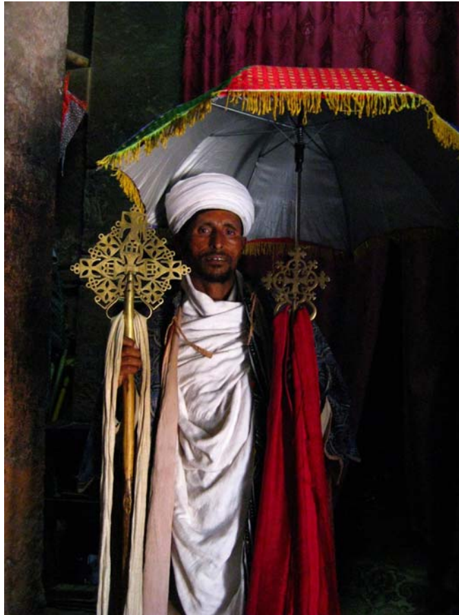
Fig. 3. Ethiopian priest with staff-mounted crosses. http://katewithdreadlocks.blogspot.com/2010/05/ethiopia.html

are emphasized through the prominent motifs of interwoven threads forming the body of these objects.