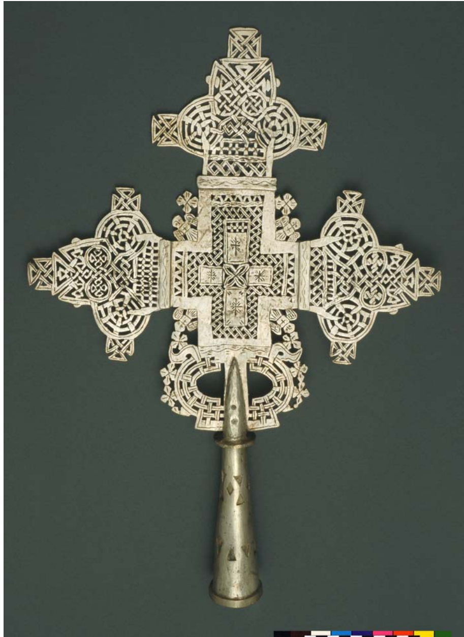
Fig. 1. staff-mounted cross

Staff-mounted crosses are very diffused in Ethiopia and are often characterized by great dimensions and very intricate decoration. They have a lower hollow shaft for insertion on a pole and they are usually cast, often in more parts that are then attached together. Although they are frequently called "processional", in reality they serve a variety of religious uses. A large staff-mounted cross is displayed to the congregation during the liturgy. Since the texts are read in Geez, a language understood by very few people today, the cross becomes a focal point on which the faithful can concentrate their gaze and prayers during the rite. When this cross is raised at the end of the liturgy, it gives the sign that the congregation can disperse. Such crosses are also displayed or taken to procession on various special occasions, like Church feasts, official celebrations, local anniversaries or times of crisis, when divine help is invoked. A characteristic aspect of all