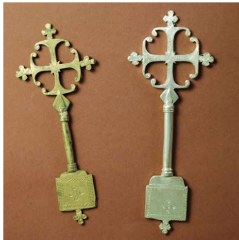
Fig. 5. Hand-crosses with a typical rectangular chest-like base. http://www.ebay.com/itm/2-X-ETHIOPIAN-COPTIC-HAND-CROSS-ORTHODOX-CHURCH-AFRICAN-ART-CHRISTIAN-ETHIOPIE-/261085290528