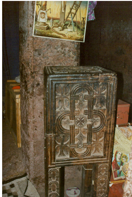
Fig. 6. Tabot.

In fact, the connection between the Ark of the Law and Christ's sacrifice on the Cross (both marking pivotal moments in the relationship between God and his people) is referenced through a unique feature of Ethiopian Christianity that has a very prominent place in Church rituals: the tabot, a sacred object owned by every church, is an ark-chest containing an altar-tablet on which the Eucharist is celebrated. The tabot is treated by special reverence that resemble the handling of the Ark in the Old Testament (for example it is covered by a precious textile when it is presented in public, and it is carried in procession, accompanied by dancing and singing). The linguistic, formal and ritual identity of the tabot clearly refers to the idea of the Ark as the container of the New Living Law (the tablet on which the Eucharist, the body of Christ, is presented). This emphatic connection between the wooden Ark and the Passion of Jesus on the wooden Cross, could be also referenced in the unique form of Ethiopian hand-crosses with their prominent (and often chest-like) base. In fact, the rectangular proportions of the base on many hand-crosses are very similar to those of rectangular tabot chests which are often decorated with crosses.