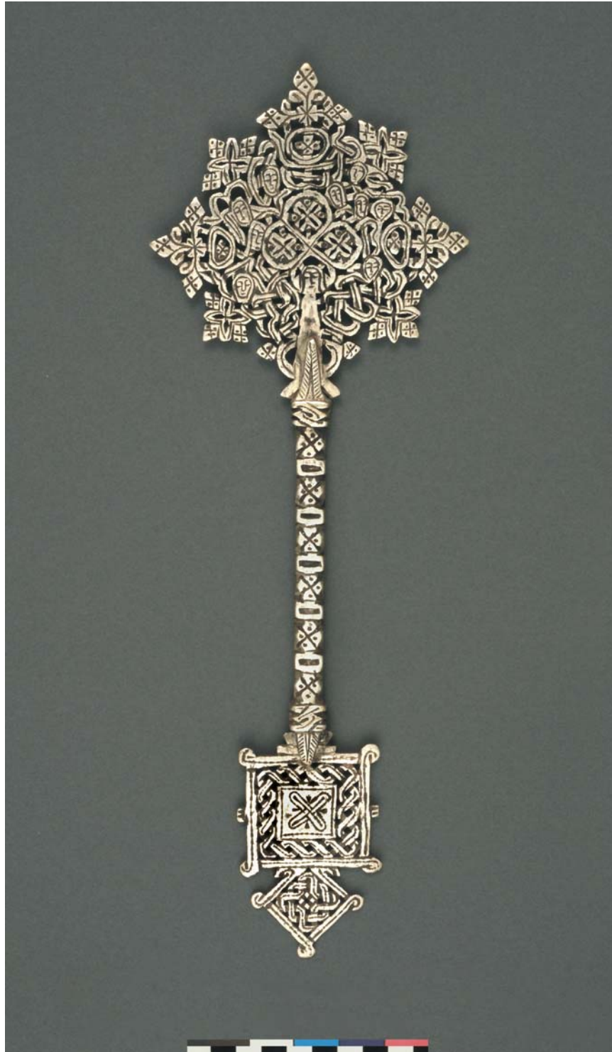
Fig. 2. Hand-cross

As already mentioned, the most prominent visual feature of Ethiopian crosses is their lace-like character that is created by motifs that resemble knotted and interwoven threads. The practical advantage of this form in the case of metal crosses is that the voids included in the formation of the lace patterns (either through casting or cutting out of metal leaves) allows for less material to be used, which results in more economic and